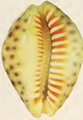
Figure 2 a